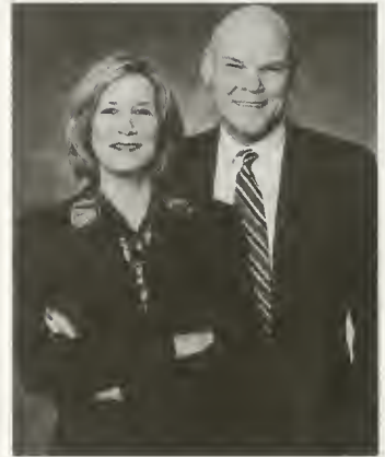
Mary Matalin and James Carville

James Carville, who holds a law degree from Louisiana State University, earned the appropro nickname “Ragin’ Cajun” while managing Lloyd Dogget’s unsuccessful campaign for governor of Texas in 1983. It would be one of the rare losses for Carville who has managed more campaigns than anyone in U.S. political history. His command of the “War Room,” Clinton’s famous Little Rock, Ark., 1992 campaign headquarters, earned him a featured role in the Oscar-nominated documentary of the same name and a 1993 Campaign Manager of the Year Award from the American Association of Political Consultants. Following Clinton’s victory, Carville worked as a consultant to the Liberal Party of Canada, to members of British Prime Minister Tony Blair’s staff and to politicians in such countries as Brazil and Honduras. He is the author of the best-selling We’re Right, They’re Wrong: A Handbook for Spirited Progressives , and the recent And the Horse He Rode in On .