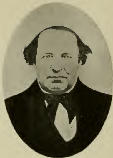
JOHN ABBOTT b. 1800, d. 1861