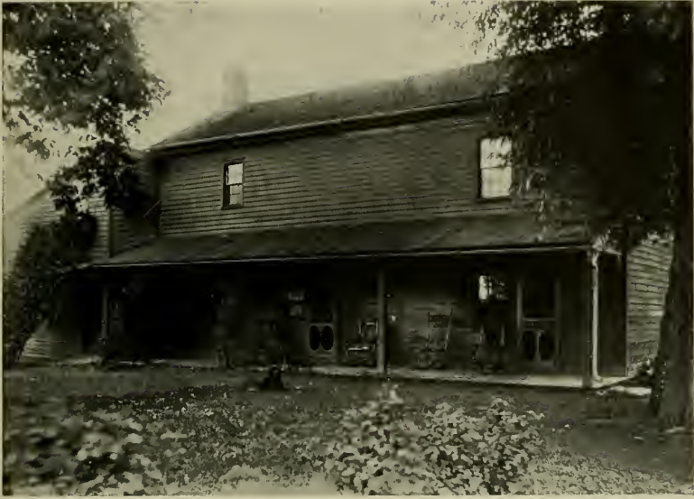
HOME OF HON. CORNELIUS CORTRIGHT (6), PLAINS, LUZERNE COUNTY, PA.