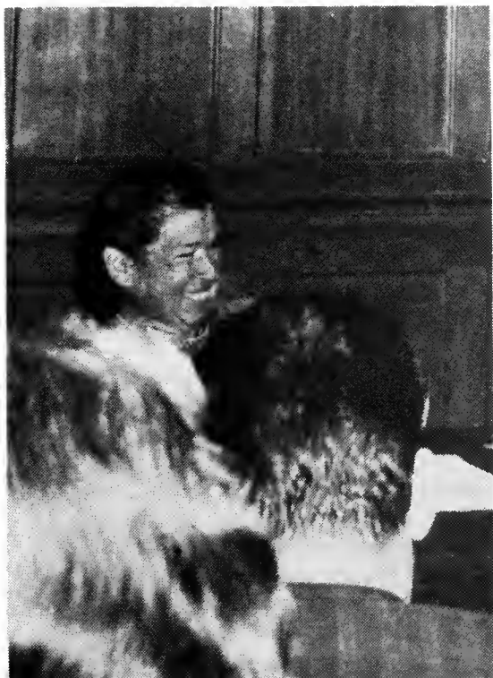
Addressing a high school teachers' group at John Swett High School, Crockett. March, 1965