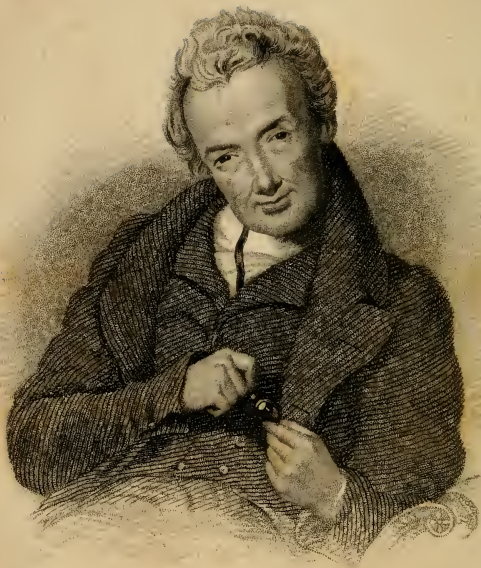
WILLIAM WILBERFORCE ESQ. M.P.